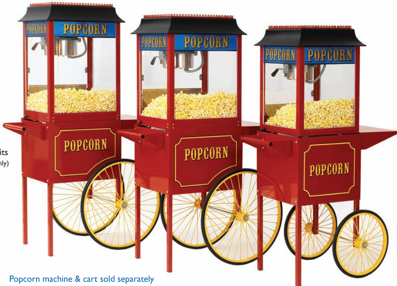
Popcorn machine & cart sold separately

Pops 147 1-ounce servings per hour. Versatile size – great for retail.